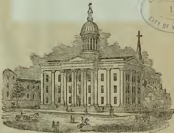
NEW COURT HOUSE.